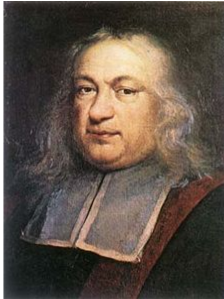
Pierre de Fermat 1601-1665