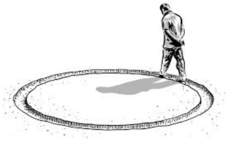
Ecclesiastes' view of time