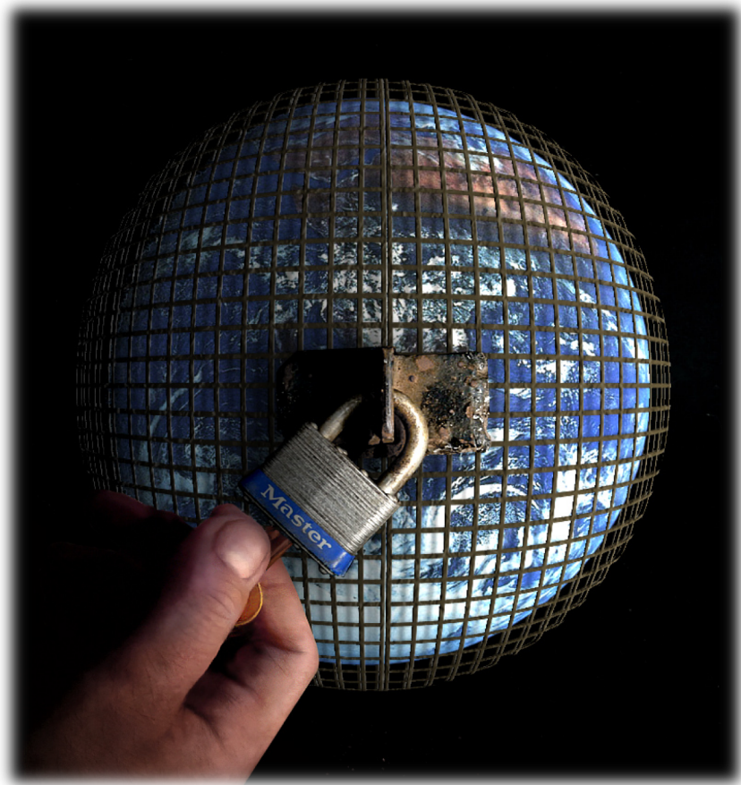
The world of Ecclesiastes