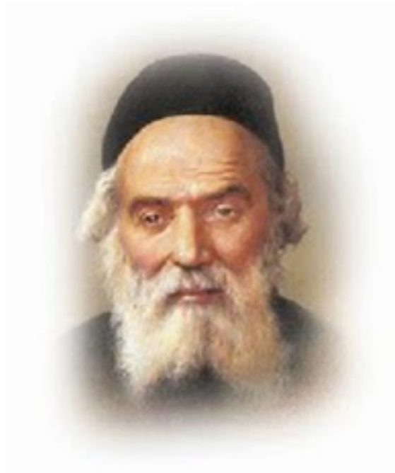
The Chofetz Chaim R' Yisrael Meir Kagan (1838-1933)

But their thoughts were darkened; for until this very day at the reading of the old covenant the same veil remains unlifted, because it is removed in Messiah. But to this day whenever Moses is read, a veil lies over their heart; but whenever a person turns to the Lord, the veil is taken away.