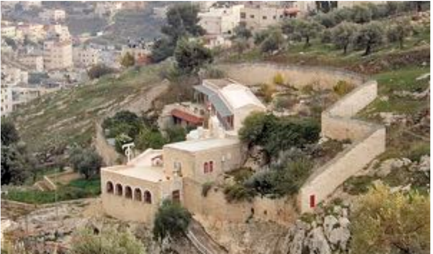
Akeldama (הקל דמא) “Field of Blood”